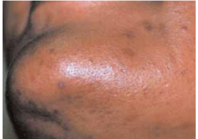
At left is the patient before laser hair removal. At right is the patient after three treatments (1 month apart) with the Nd:YAG (1064 nm) laser at a fluence of 40 J/cm 2 and a pulse width of 40 ms.

for the growth phase, or anagen phase, of the follicle. High-dose ALA/PDT kills nearly 100% of anagen hairs.