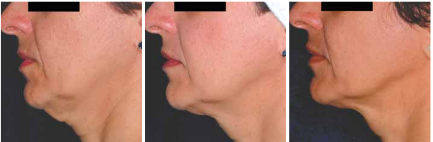
The photos above show the progress of skin tightening treatment with Thermage. The photo at left is pre-treatment; middle photo shows 2 weeks post-treatment and the photo at right is 6 months post-treatment.