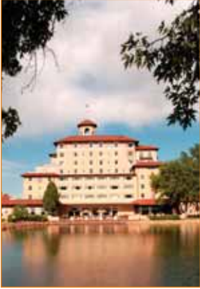
The BRO A DMOOR Hotel (pictured above) in Colorado Springs was the luxuriant and relaxing setting for the 2005 Controversies and Conversations in Laser and Cosmetic Surgery meeting.