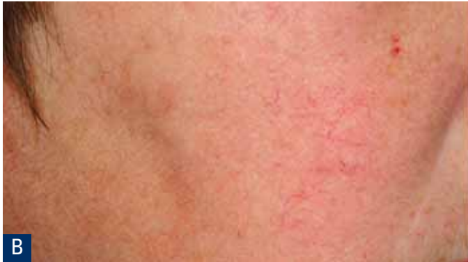
Telangiectasia treated with the two laser wavelengths (532 nm/KTP and 1064 nm/Nd:YAG) of the Gemini.

We still need a better understanding of the best approach for treating various vascular lesions. Manufacturers and researchers must work together to continue expanding our options. ■