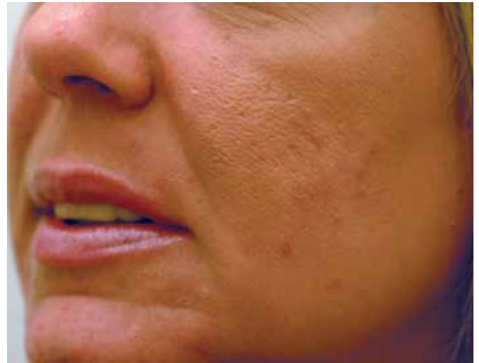
BEFORE (left) AND AFTER FOUR TREATMENTS (right): ALA and ClearLight: Acetone scrub; ALA incubation: 30 minutes; ClearLight: 4 minutes.

mens foolproof. However, a look at the literature did provide some elementary insight into the success rates of ALA/PDT in treating some of the following conditions.