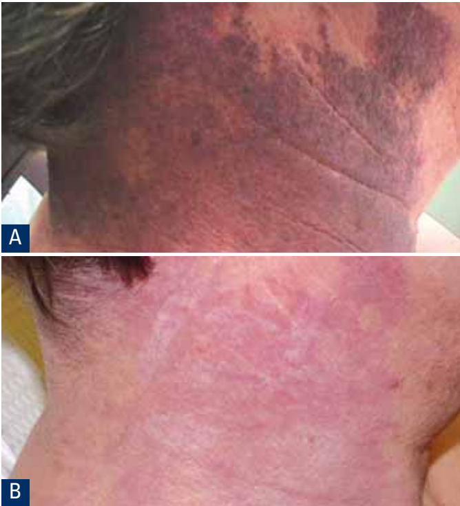
Port wine stain on the neck before treatment (A) and after treatment (B) with a pulsed dye laser.